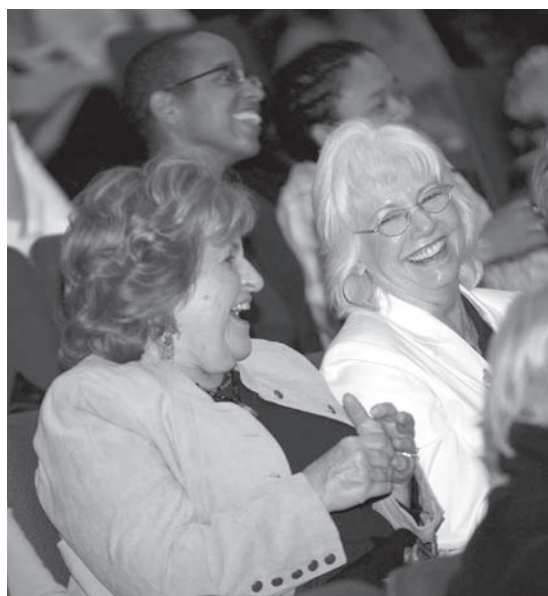
The girls get funny at Funny Girls & Dynamic Divas .

Many corporate friends and business sector partners supported our activities from flood recovery to Sistas and Thanksgiving. To all our volunteers over the past year, who so generously donated their time, sweat, tears, and laughter we offer our deepest thanks — we could not have done all this without you!