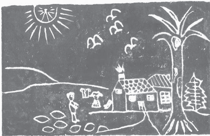
I was a Salesperson selling clothes.