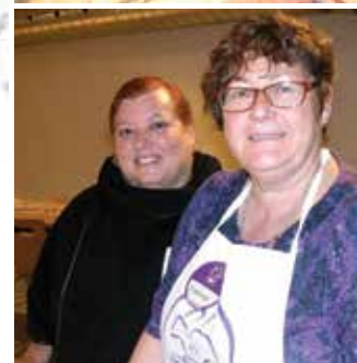
Toronto Dish Soup Sisters invite people to come together and make 200 servings of soup for Sistering to nourish and nurture women in their time of need.

we award grants, we look at the impact a program has on the end user. And there is no question that Sistering positively impacts isolated and vulnerable women - and for this program, seniors."