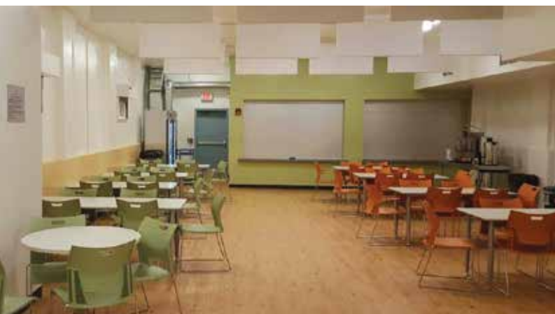
Renovations have created a safe, comfortable and welcoming space for the increased number of

The Drop In Community Support team is in the process of implementing evening programs that will meet a variety of needs as identified by participants. These proposed activities include: games, movies, art therapy, and social group for women, stretching, pet care, and esthetic services.