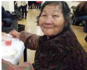
Thanks to generous support from Rotary Club of Toronto, we offered programs supporting the special needs of senior women.