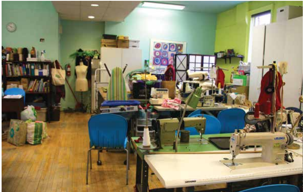
Spun Studio and Inspiration Studio, our innovative social enterprises, offer marginalized women the opportunity to learn pottery and textile skills in a creative and collaborative environment.