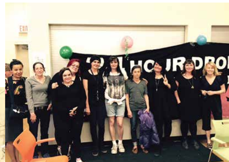
Sistering’s grassroots advocacy initiatives on the streets and inside the system put the issues facing homeless and marginalized women on the social agenda.