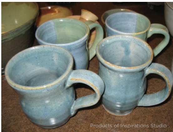
Products of Inspirations Studio