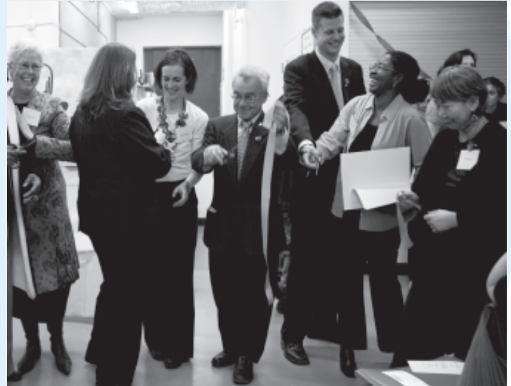
Sistering officially opens at 962 Bloor Street West

This year Sistering developed a new Strategic Plan for the agency, for the years 2007-2010. The strategic planning process began in spring of 2006 and the plan was approved by the Board in November. The plan builds on our existing strengths and sets out three strategic directions for 2007-2010: to continue to make life better for women who use our services; to work well inside Sistering; and to respond effectively to the world around us, with a special focus on adapting to the new location and to new women now coming to the agency. We have moved into a neighbourhood with many women very much in need of the everyday miracles our staff perform with their welcoming attitudes, their well-developed