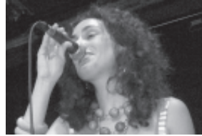
Sistering Reports pages 2 to 6.