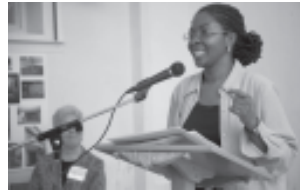
Message from Executive Director page 2